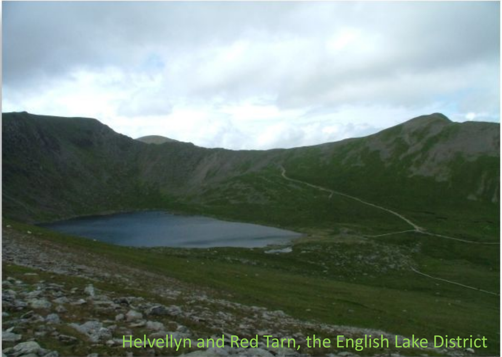
Helvellyn and Red Tarn, the English Lake District