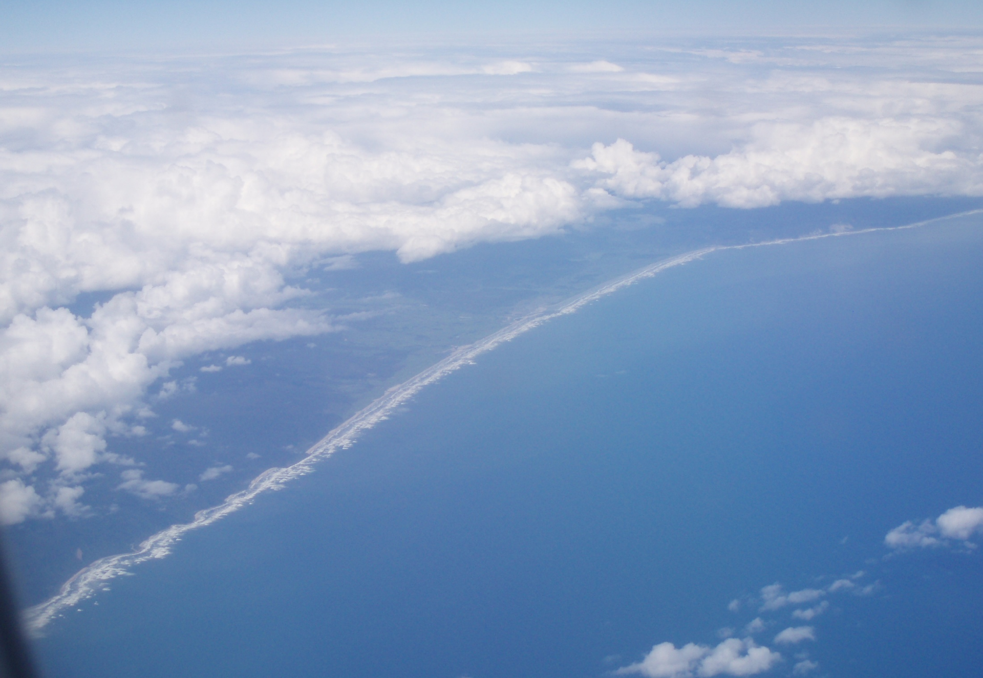
Aotearoa, from Air New Zealand flight NZ38