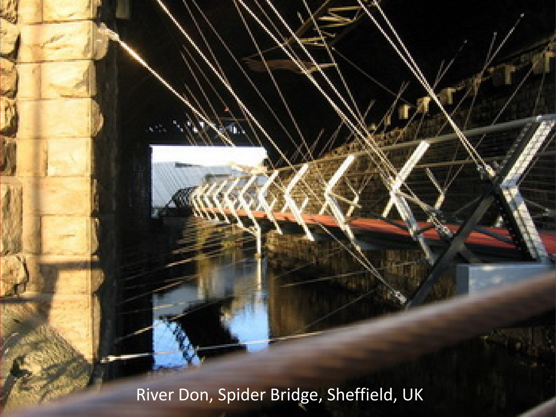
River Don, Spider Bridge, Sheffield, UK