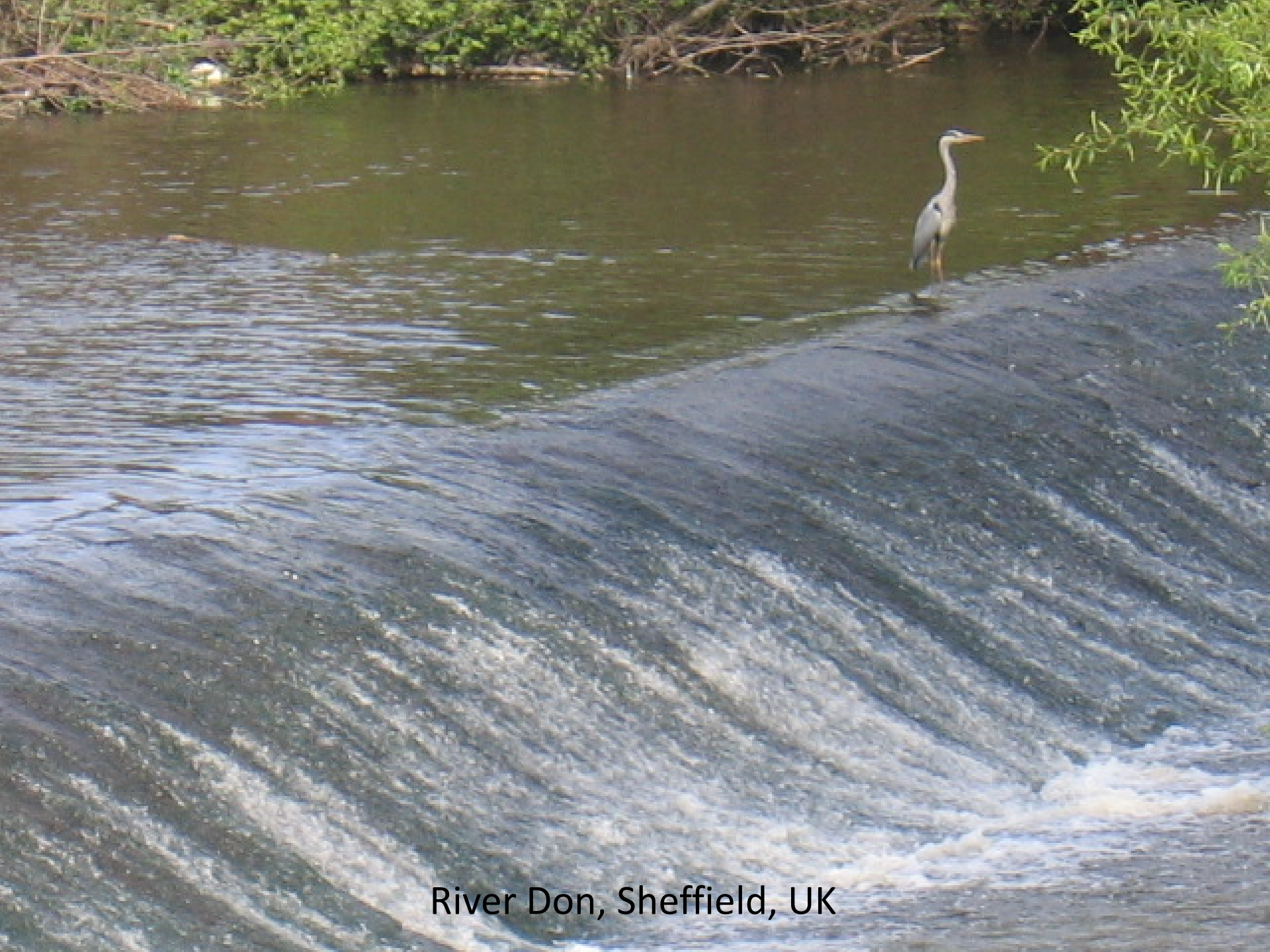
River Don, Sheffield, UK