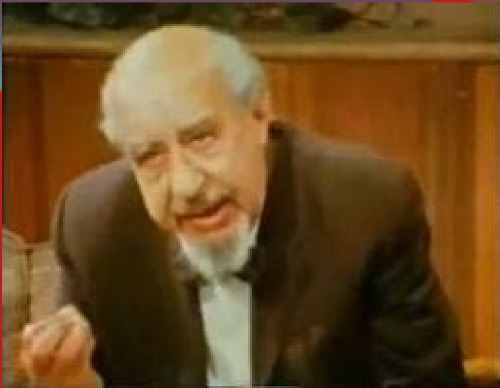
Fritz Perls (1893-1970)