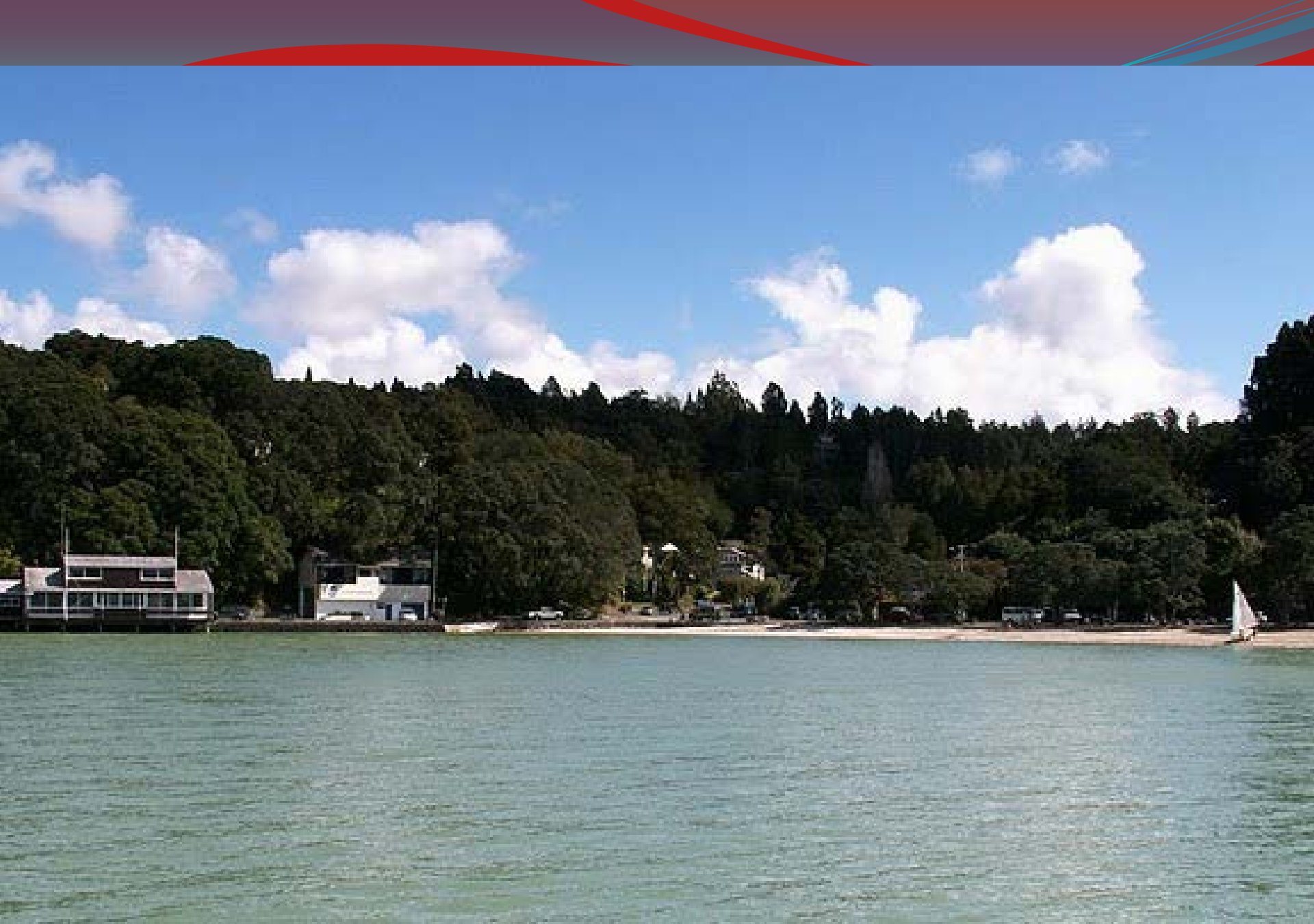
Titirangi, Manakau Harbour