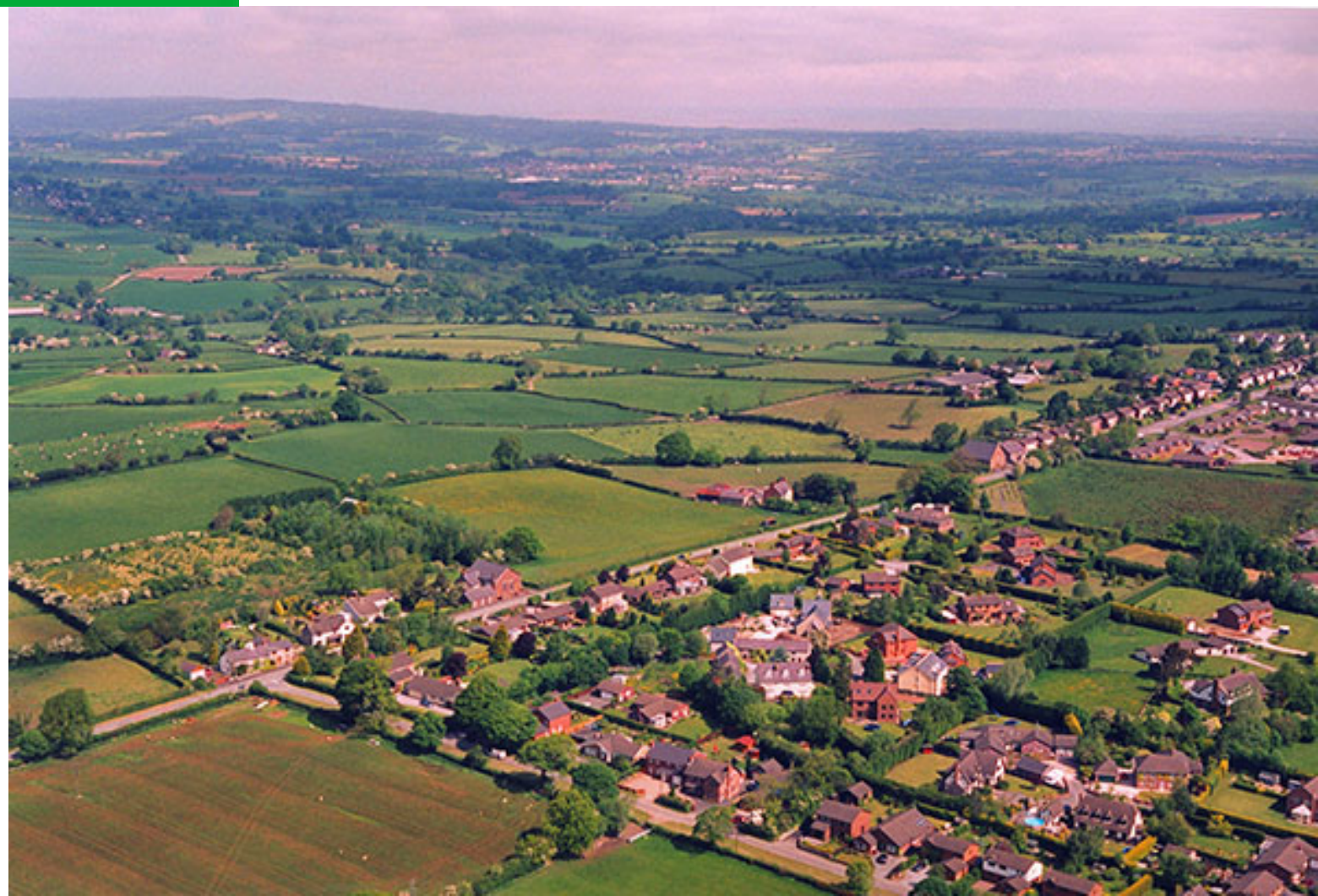
Treuddyn, Flintshire, Wales